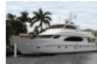
90' Hargrave 2009 My Lady M - $5,877,000