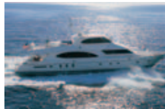
96' Hargrave 2005 Bamboleo - $3,850,000

FEBRUARY 17 - 21, 2011 | COLLINS AVENUE | MIAMI BEACH | DIRECTLY ACROSS FROM THE EDEN ROC HOTEL | RAMP 21