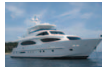
100' Hargrave 2009 Perfect Harmony - $6,695,000