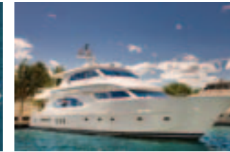
96' Hargrave 2008 Lady Jan - $4,990,000