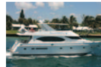
68' Hargrave 2004 Vitesse - $1,495,000