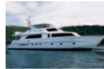
93' Hargrave 2007 Donna Marie - $4,950,000