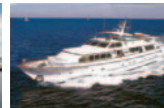
106' Denison 1986/2010 Zantino III - $1,990,000