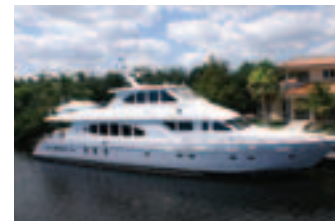
96' Hargrave 2004/2010 MaryClare - $3,495,000