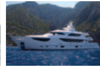
136' Hargrave 2011 Dreamer - $19,000,000