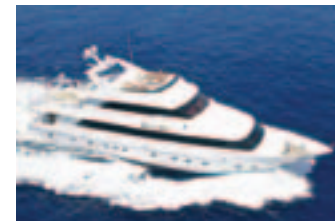
115' Hargrave 2005/2010 Missy B II - $5,900,000