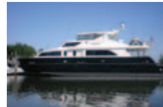
90' Hargrave 2005 Grumpy - $4,450,000