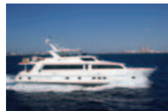
101' Hargrave 2008 Seafarer - $5,900,000