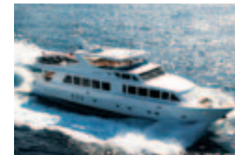
101' Hargrave 2010 Sassy - $6,700,000