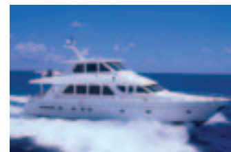
78' Hargrave 2003 Shekinah Glory - $2,595,000