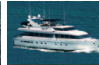
84' Monte Fino 1998 Lady Di - $1,645,000