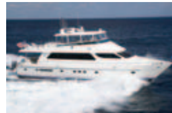
78' Hargrave 2007 Goose Bumps - $3,275,000