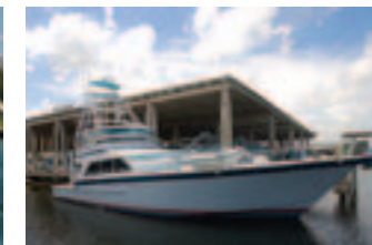
70' Striker 1984 War Eagle - $395,000