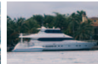
84' Monte Fino 2001 Sea La Vie - $2,550,000