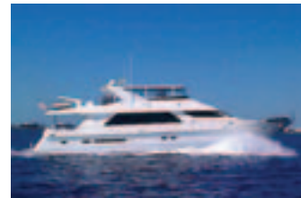
68' Hargrave 2004 Contessa - $1,579,000