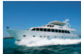
97' Hargrave 2006 Cocktails - $4,900,000