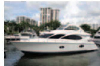
68' Lazzara 2008 Lady of the Seas - $2,190,000