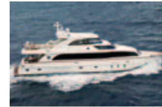
101' Hargrave 2009 King Baby - $7,500,000