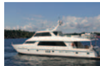
101' Hargrave 2010 SeaVenture - $7,200,000