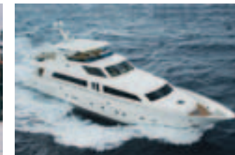
114' Hargrave 2009 Sea Legend - $6,500,000