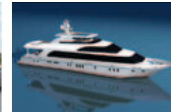
125' Hargrave 2012 NEW BOAT - $14,300,000