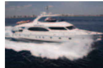
97' Hargrave 2006 Hooter Patrol IV - $4,500,000