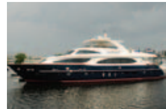
99' Hargrave 2005 Da Bubba - $4,395,000