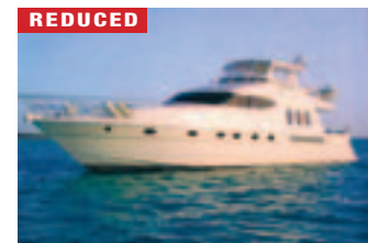
68' Viking/Princess Sport 1999/2007 Untamed - $795,000