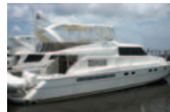
65' Fairline 1996 Pegway - $540,000