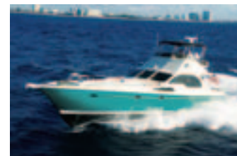
52' Texas/Custom Paradise - $1,350,000