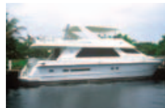
68' Hargrave 2003 One 2 Sea - $1,595,000