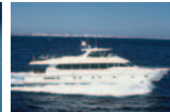
92' Monte Fino 2000/2009 OffTrack - $2,625,000