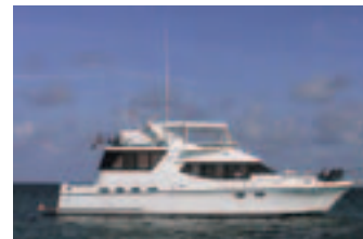
54' Ocean Alexander 1996 Lady M - $697,000